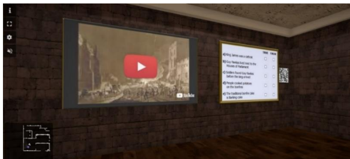
Figure 1. Second room displaying the Listening exercise

Vocabulary and Listening Training Room. The second room focuses on presenting the vocabulary of the unit through a series of interactive picture frames that will allow the students to browse through and review them at their own time. It also hosts an embedded YouTube video with the unit’s listening activity and an image frame with some True or False questions accompanied by the QR of the exercise for enhanced accessibility (Fig. 1.)