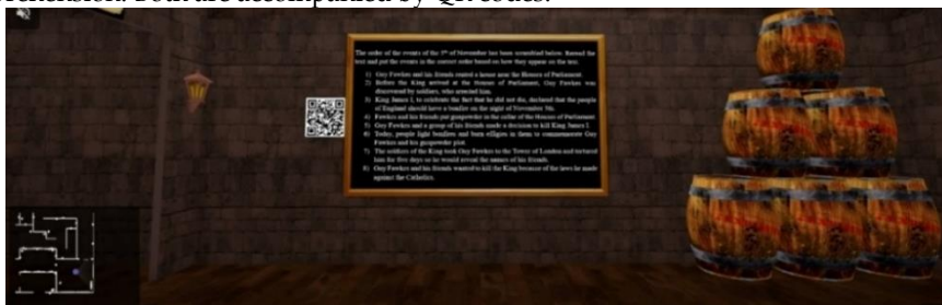
Figure 2. Room Four displaying the Vocabulary and Reading activities, Part One

Vocabulary Activities and Reading Evaluation Room. The fourth room (Fig. 2) will focus on evaluating the knowledge the students have already acquired through the use of two exercises. It includes an interactive reading exercise, where students need to put the scrambled events in the correct order, and a matching exercise focusing on vocabulary comprehension. Both are accompanied by QR codes.