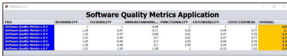
Figure 1. Metrics calculated from the SQMetrics tool.

The interested reader can find more about the SQMetrics tool in (Σωφρονάς, 2020).